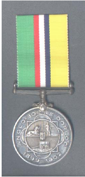
Anglo-Boere Oorlog Medal