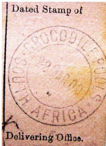
Detail of Crocodile Pools Siding cancellation