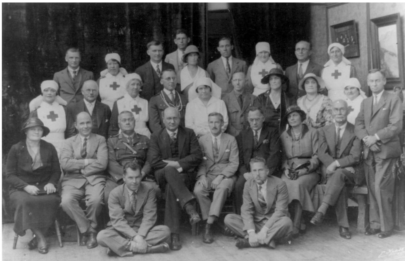
Groepfoto 8 : Vrystaatse Departement van Onderwys se Kampkomitee gedurende die Onderwysweek, 1932.