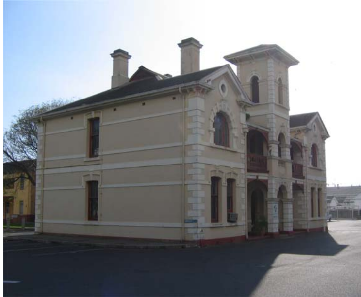
Administration Block, City Hospital for Infectious Diseases, Portsworld Road, Green Point, Cape Town

The first voluntary efforts to combat tuberculosis in South Africa originated in Cape Town in 1904 under the chairmanship of the then Prime Minister, Dr. Leander Starr Jameson. However, despite patronage by many of the luminaries of the day, progress was slow. It took AJA until 1909 to induce the city fathers to allow him to open a diagnostic-treatment clinic at the City Hospital. A steadily expanding service positively influenced the local control of tuberculosis leading to a declining death rate from the disease within the metropolitan boundaries. The Society for the Prevention of Consumption was established in 1911 under the Chairmanship of AJA. This and the Jameson Committee are considered by some to represent the beginning of the South African National Tuberculosis Association (SANTA).