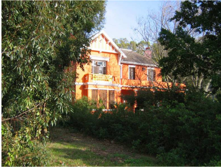
"The Residency", Portswood Road, Green Point

xv Up until that time, he had lived at "The Residency", Portswood Road, Greenpoint - currently the Cape Medical Museum . He moved to "Terenure", Queens Road, Sea Point.